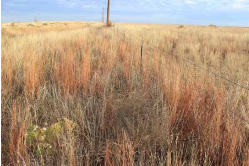
Left: Collingsworth County CRP grasses